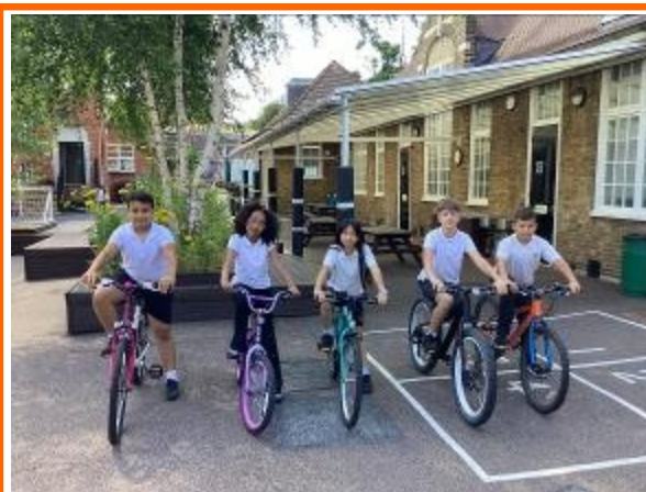
Children in Year 6 took part in Camden Bikeability — a national cycle training programme to improve their cycling skills and their confidence. Well done!