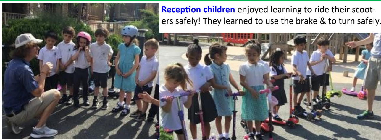
Reception children enjoyed learning to ride their scooters safely! They learned to use the brake & to turn safely.