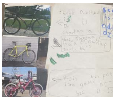
Writing about bikes