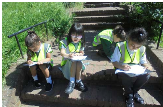
The children had a great time and learned lots!